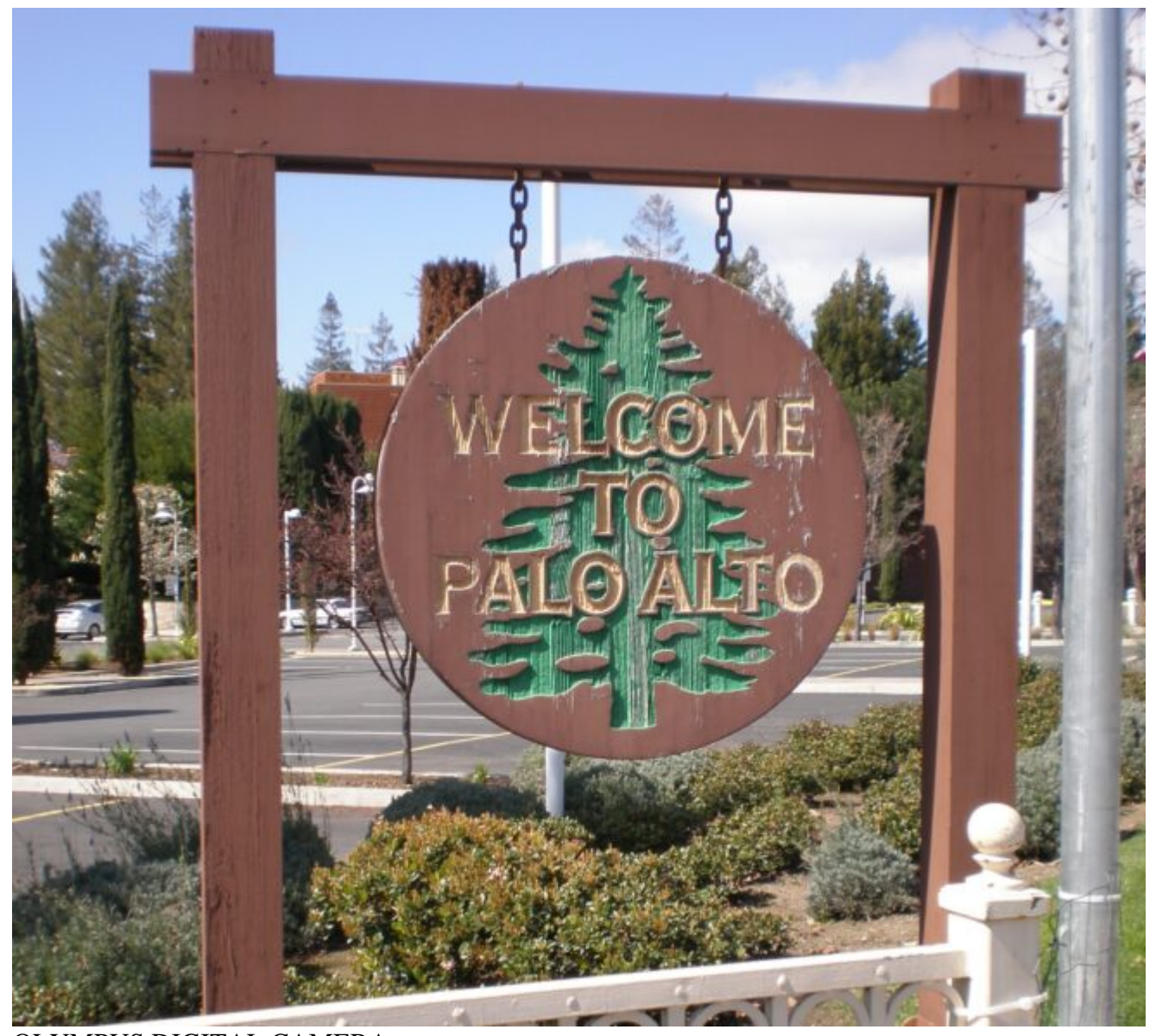
OLYMPUS DIGITAL CAMERA

This decision underscores the importance of meticulous compliance with the requirements and deadlines of the Mitigation Fee Act. Five-year findings must be made for all development fees that fall within the Act's definition, whether or not paid electively in-lieu of some other condition of approval. The findings must be made within 180 days of the end of the applicable fiscal year and must cover all unexpended fees in the fund, not merely fees held for more than five years. Agencies that fail to adopt findings within the statutory period or adopt findings that do not meet the strictures of the Act are at risk of having to refund the entire balance to then-current owners of the properties subject to such fees.