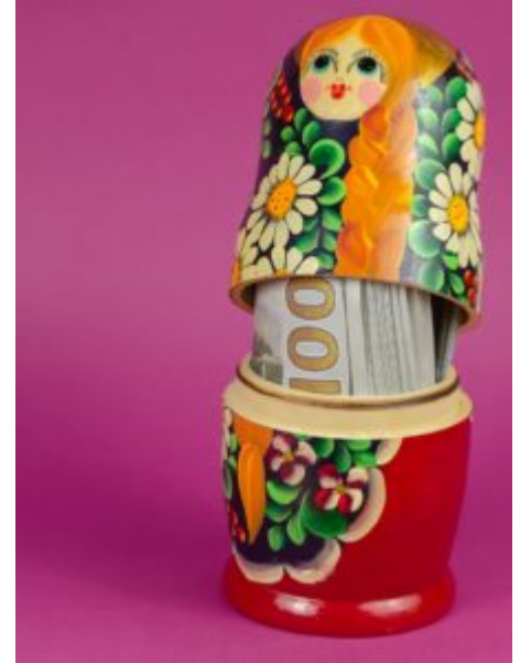
On April 14, 2022, the Financial Crimes Enforcement Network (FinCEN)