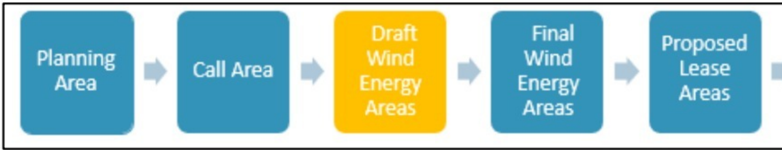
Figure 1. Introduction of draft WEAs into BOEM renewable energy authorization process, highlighted in orange [4]

BOEM arrived at the final WEAs after a series of public outreach opportunities, including a 60-day comment period, in-person public meetings, and active coordination with the state of Oregon and the intergovernmental task force. Area Identification Memorandum at pp. 10-11. BOEM's process in Oregon has involved significant stakeholder engagement since 2020 (including tribes, ocean users, coastal communities, the fishing community, state agencies, and the general public), signaling its continued commitment to identifying and responding to stakeholder concerns early in the process.